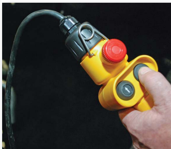
The HB-20 bender and tooling package incorporates an electronic controller tethered to the machine that allows the operator to be as far as 6 feet away from the unit.