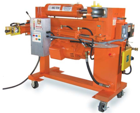
The Huth Heavy Duty Model 2600 Bender