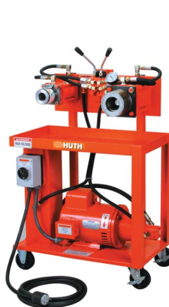
The Huth Model 1674 Expander is one of the company's latest introductions.