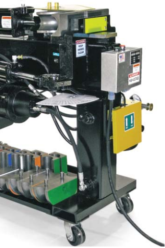
The Huth Model HB-10 bender is a top seller.