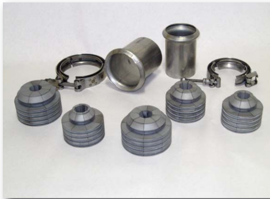
Huth V-Band Segment Set Tooling and a piece of formed tubing.