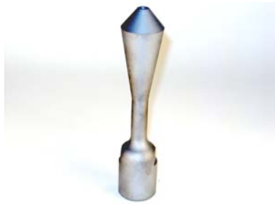
573 Arbor 1 3/4" ID to 4" ID Comparable to 508 & 499