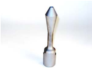
572 Arbor 1 3/8" ID to 1 3/4" ID Comparable to 508 & 498

The 572 and 573 Arbors are used with the 472 thru 478 segment sets.