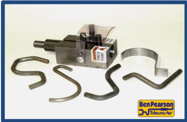
Ben Pearson Part #75985 Rod Bracket Bender

Fits models MB97, BP79, BP08, BP11, 3012.